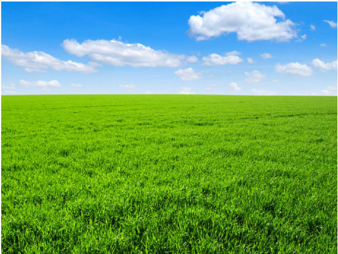
Talud met grasland